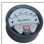
Differential Pressure Gauge

Dwyer make Magnehelic gauges are used to measure the pressure drop HEPA filter 0-500 Pa.