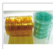
Soft Wall Material